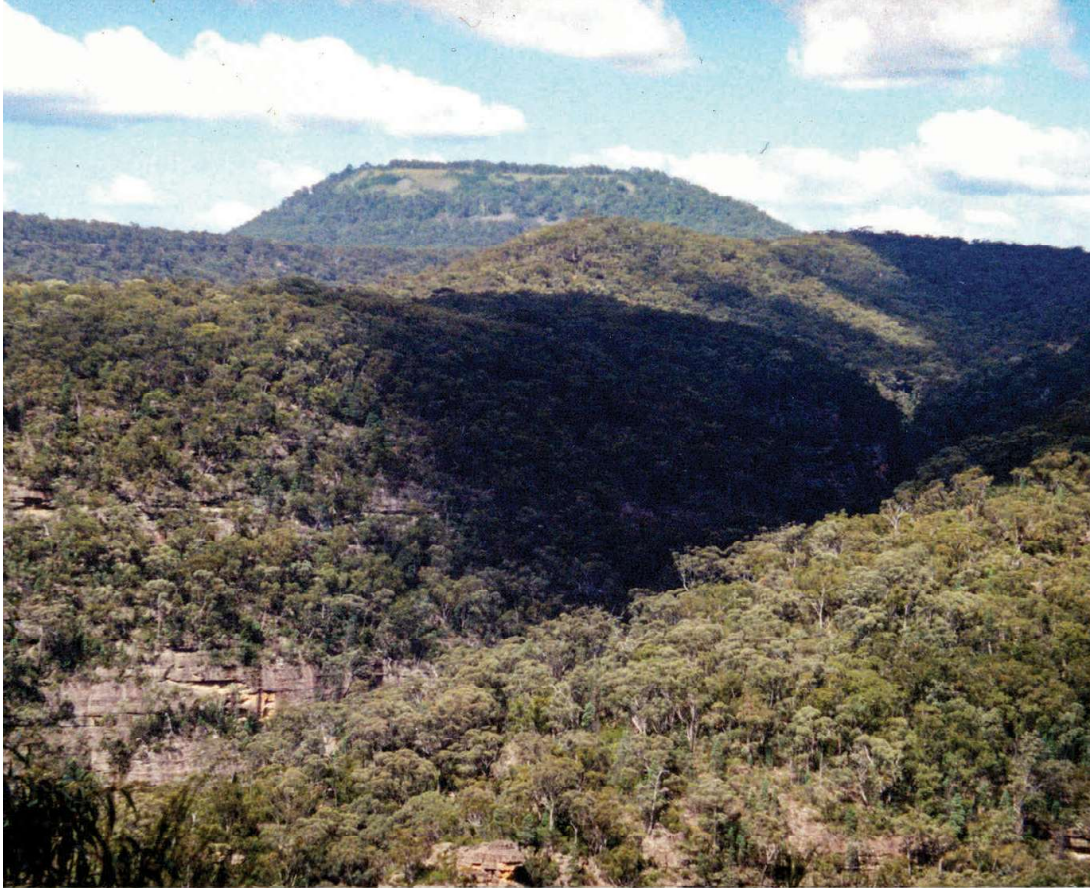
ABOVE: View of Mount Pomany from Mount Cox.

These were indeed found so essential in the survey necessary to determine the best line for the road, by enabling him to know his position in all places, that his first step was to clear the summit of Warrawolong (which was broad, and covered with enormous trees), and next to complete the series of triangles, by angles observed at that station; and at Kutenbun, the Broken Back, the Yellow Rock, and Wambo which stations were likewise cleared of heavy timber for this purpose, as were also various nameless summits of the ranges.